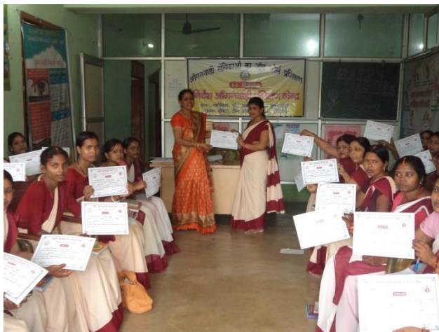
[Job Course Certificate Distribution Activity]

NIRDESH in collaboration with Directorate of ICDS, Bihar is running 02 Anganwadi Training Centres since 2004-05. The main task of AWTC is to conduct training of AWWs and AWHs through job training courses and refresher courses. The inputs given in the job training courses are very intensive in the area of Child Development, Health and Nutrition, Community Participation and Management of AWC. In current financial year, 262 AWWs (Sevikas) from 05 districts namely, Sitamarhi, Siwan, Gopalganj, Bhagalpur and Madhubani trained in Job Course towards preventive and curative measures of the targeted beneficiaries (0-6 years children, adolescent girls, pregnant and lactating women). Since inception of 2 training centres, we have trained a total of 19655 AWWs.