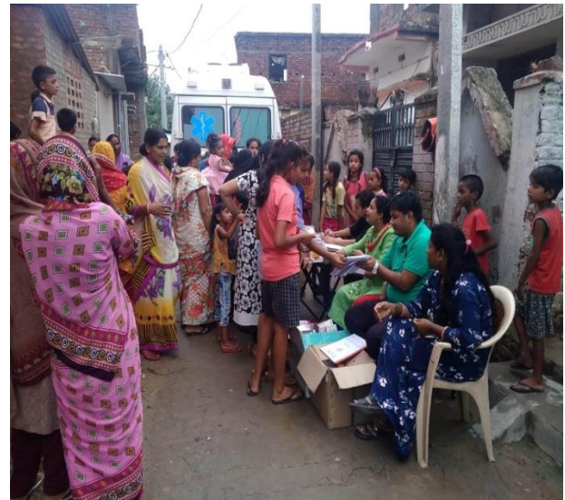
[Doctor counseling Mothers on Pre & Post Healthcare of Child and Mothers, Free medicine distributed]