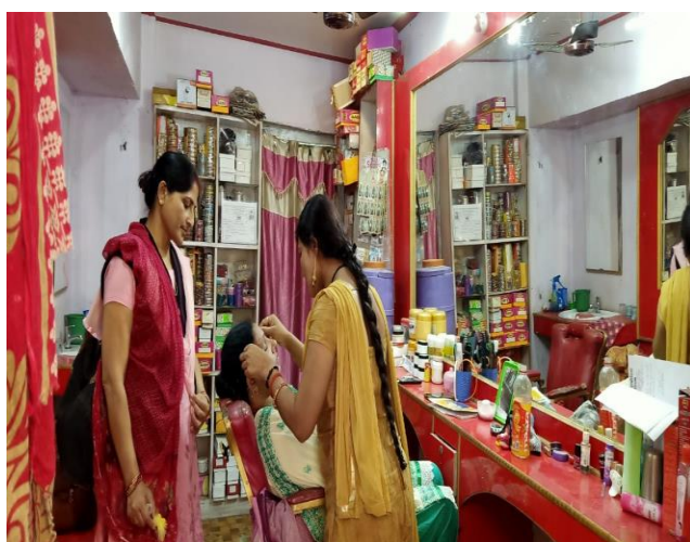
[Trainees learning Health Care & Beautician]