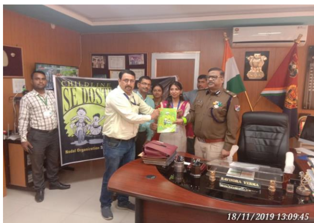
[IG, RPF, GM office (Rly.), Hajipur]