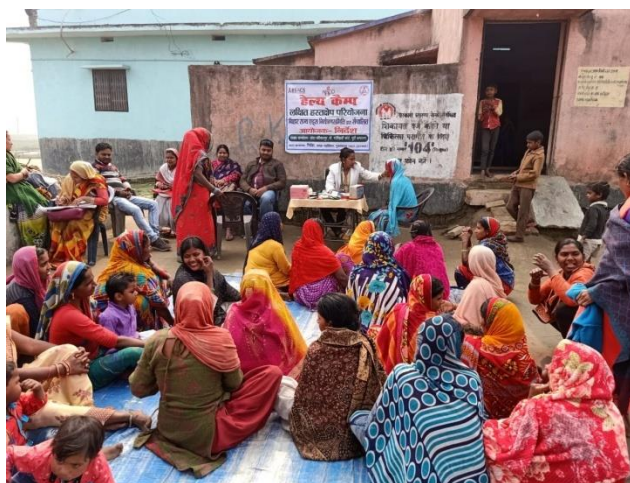
[Community Health Camp]