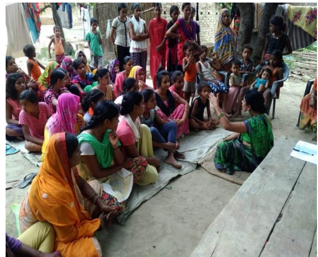
[ANM Counseling Mothers and Adolescents on Healthcare & Hygiene]