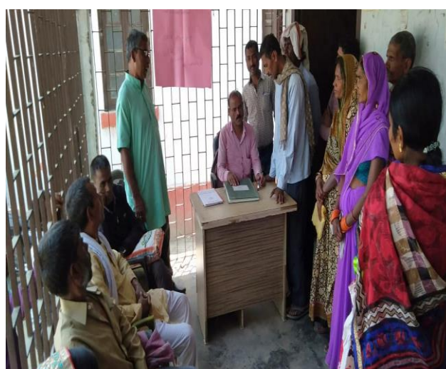
[Support Group Meeting with PLHIV]