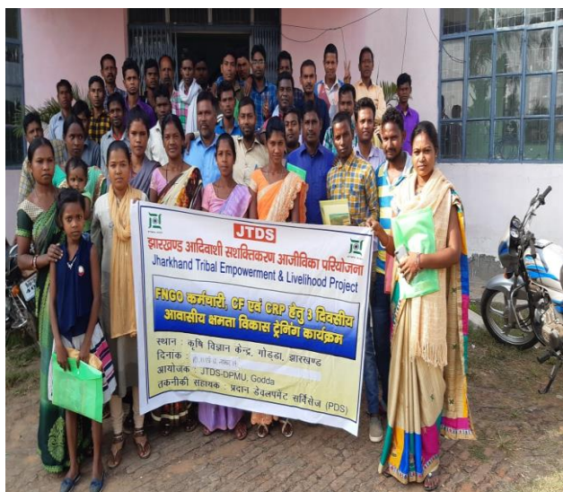
[Group Photos of Team of JTDS, Godda]