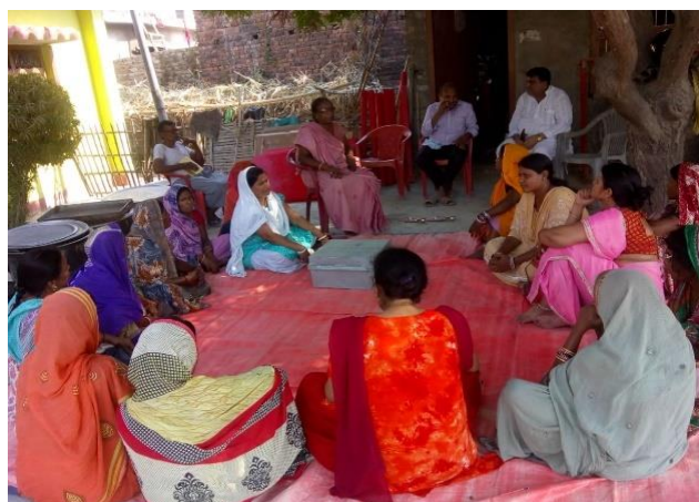
[Discussion on Significant policy/Regulations Changes]