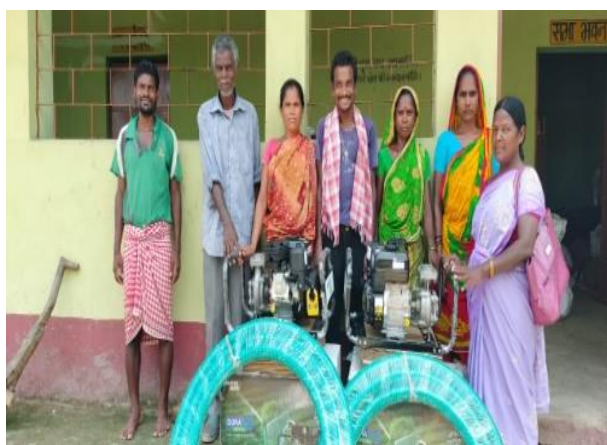
[Pump set distributed to farmers of Bhatbhanga Santhali, and Youth farmer in his vegetable field, Rampur; both from Taljhari block, Sahibganj district, Jharkhand]