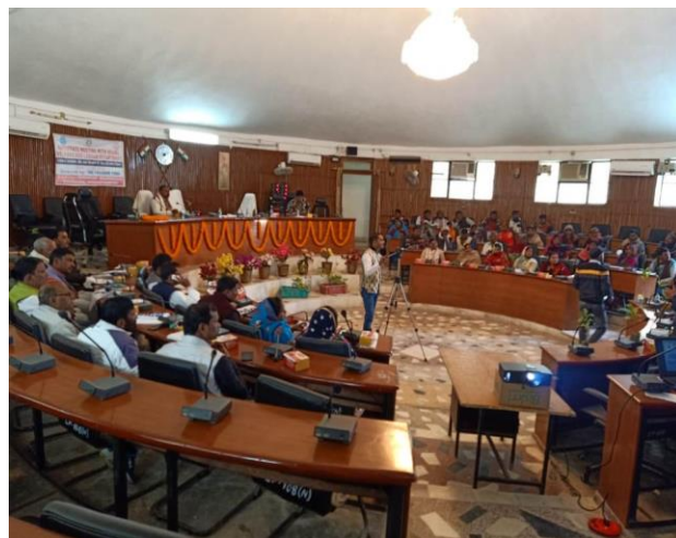
[Interface Meeting with MPs/MLAs, Social Welfare, Labour and Health Departments on Protection of Children]