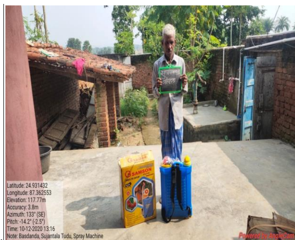
[Beneficiary Spray Machine]