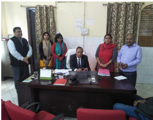
[THF Program Officers with Civil Surgeon, Motihari]