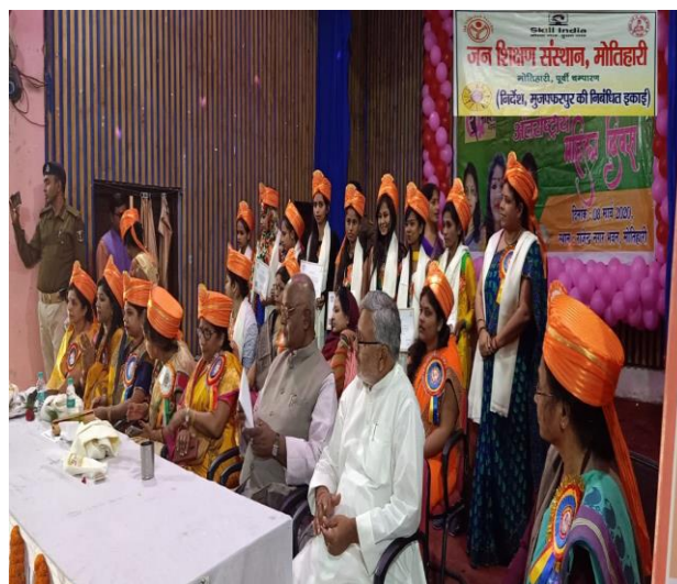
[Shri Radha Mohan Singh, MP, Motihari Inaugurating Women Day Celebration in Jan Shikshan Sansthan, Motihari]