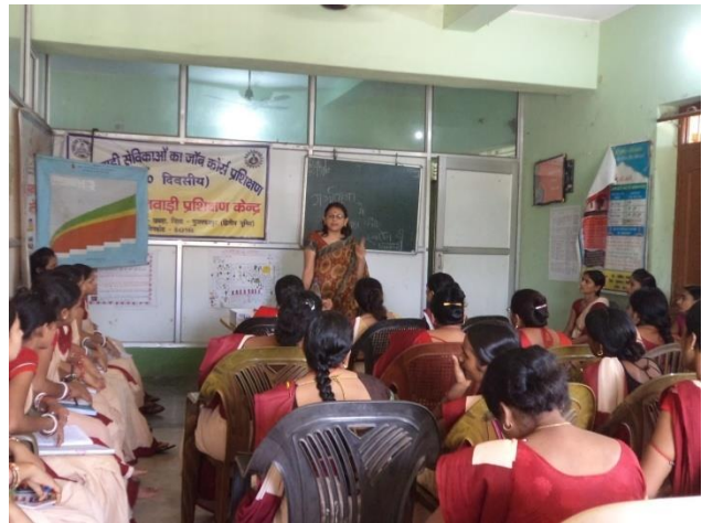
[Job Course Training of AWWs]