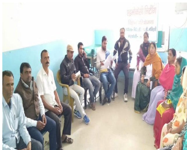
[Advocacy Meeting with ARTC & ICTC officials]