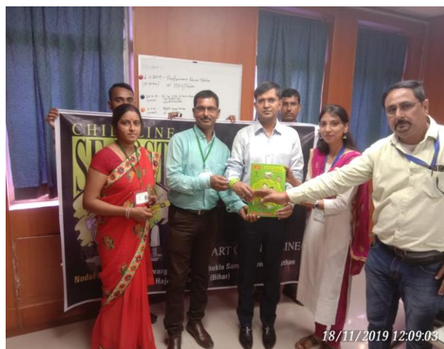
[CPRO, Railway, GM Office, Sonepur with CHILDLINE Railway]