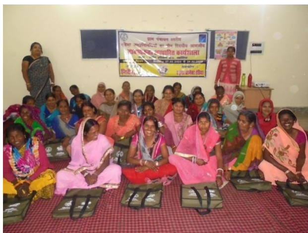
[EWRs participating in Need Based Workshop]

Saraiya and Motipur covering 97 Panchayats year by year. This project intends to Enhancing Constituency Building of EWRs and Strengthening Women's Political Leadership in Local Governance. The project proposes to empower Elected Women Representatives (EWRs) of Kanti and Marwan blocks this year so that they become capable to deliver their roles and responsibilities effectively and to deliver welfare scheme benefits to the bottom line communities. The project covers 35 Gram Panchayats of above 2 blocks.