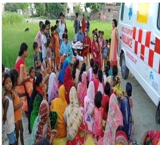
[Doctor Counseling Mothers Pre & Post Child and Mother Healthcare]