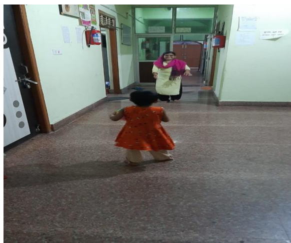
[DM, Motihari on Monitoring Visit in SAA, Motihari] [Girl child playing with the ball]