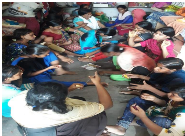
[Vocational Skill training to Youths on Dress Making and Beauty Culture & HealthCare]