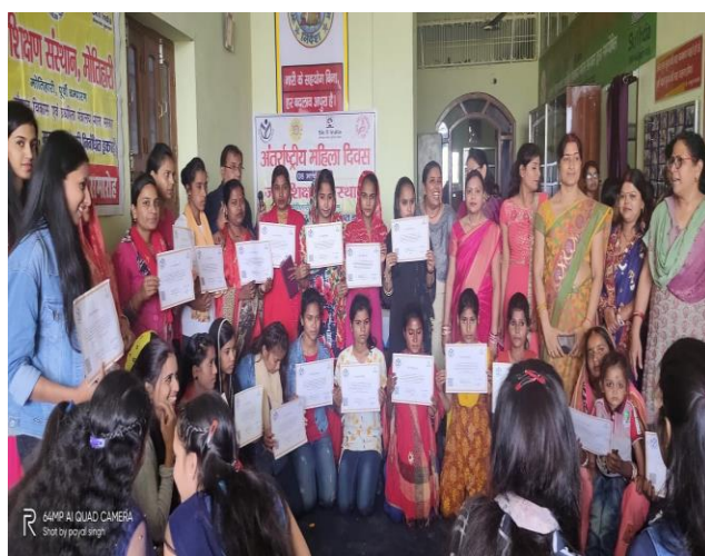
[Certificate Distribution to trainees on Women Day]

The Hunger Project: Strengthening Elected Women Representatives (EWRs) and Federation to Enforce Human Rights of Marginalized