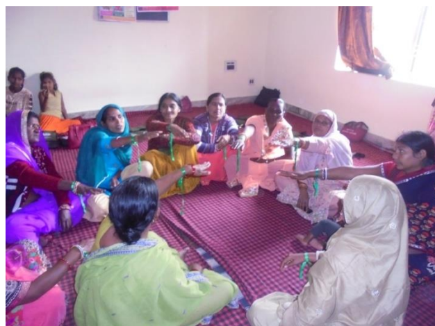
[EWRs Cluster level Federation Meeting]