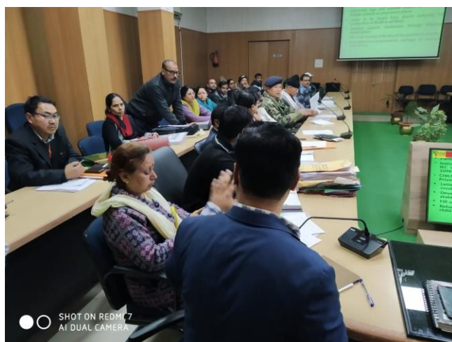
[Integrated Meeting with CAB/DCPC, Muzaffarpur]