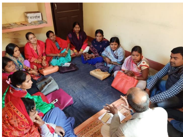
[Additional director, BSACS Reviewing Program with Staff]