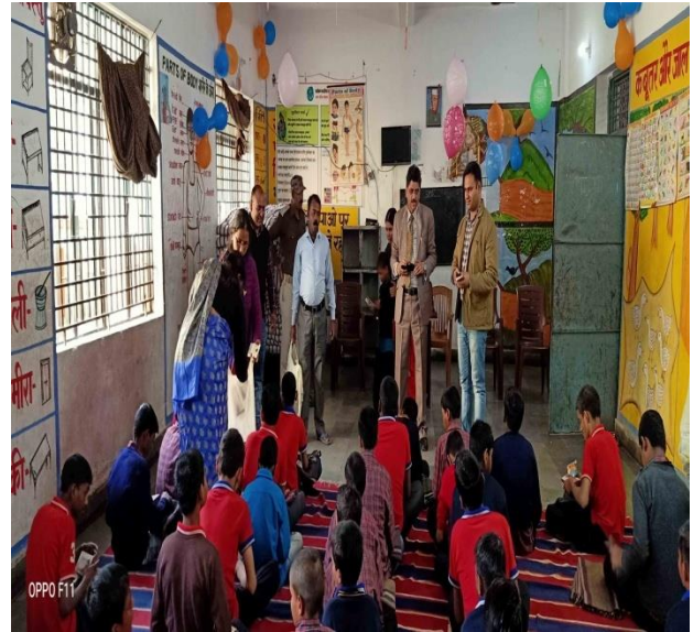
[ADJ, Muzaffarpur Review in Children Home (Boys)] [ADM, Muzaffarpur interacts with boys]