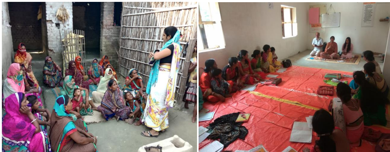
[Teachers conducting meeting with Mothers, at Paliganj] [IIMPACT Teachers Teaching Training]

The various other activities organised are Health Camp in collaboration with PHC, Environmental Protection Issue, National Days celebrations like Republic Day, Independence Day, Gandhi Jayanti, Balika Diwas, etc. The girls at our centres are also participating in drawing and singing competitions. For managing each centre, 71 Centre Management Committees (CMCs) are formed and conducted 505 meetings while 729 Parents Teachers Meeting conducted.