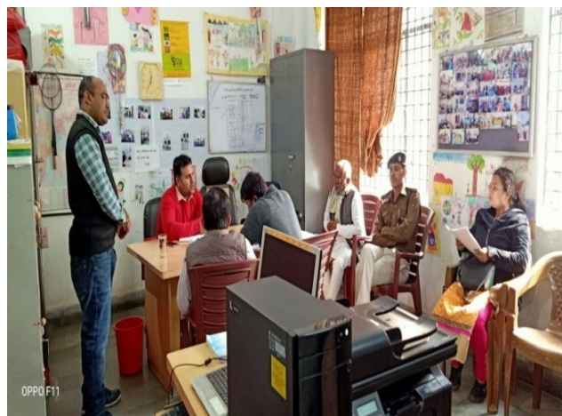
[DM, Muzaffarpur celebrating CHILDLINE Se DOSTI program][Monitoring Visit in Children Home (Boys), Muzaffarpur]