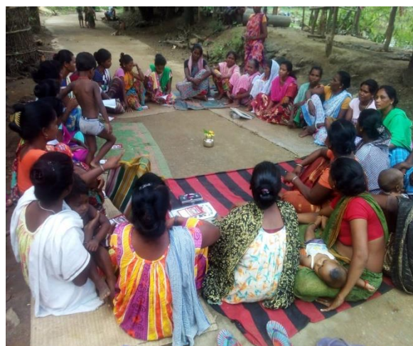
[SHG group meeting]